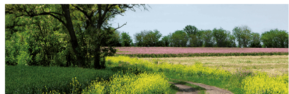
Nature of Vesthimmerland